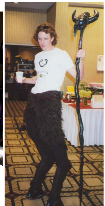
A Modern Day Satyr. Probably the coolest costume there.