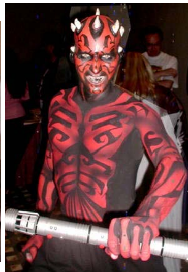
Darth Maul, body painted from the waist up.