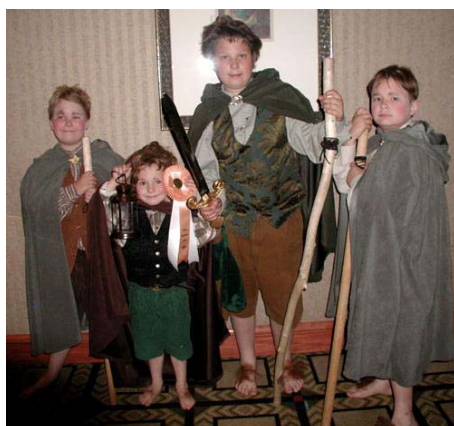
A group of Hobbits.