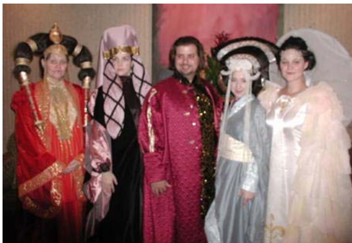
Best in Show. Only the Queen's Hairedresser can identify the real Amidala.