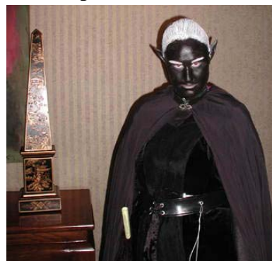
Live Action Roleplaying was very popular at the convention.