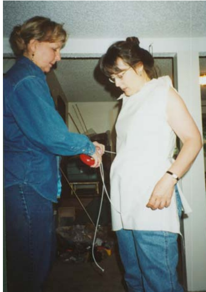
Establishing the waist line, using weighted drapery cord.