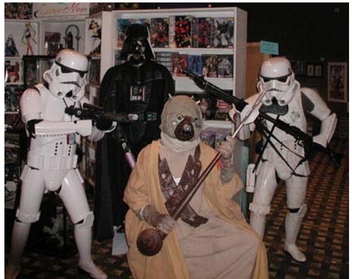
I traveled to the con with a couple of troopers and spent Saturday morning in my new Tusken Raider Costume.

The Masquerade had about 19 entries. I think it was 14 when the Green Room opened, but several were added. There were 3 Master entries, 1 Journeyman and the remainder were Novice, with a couple of Rising Stars (children's) entries. One Master entry was a scratch, the other took Best in Show (Presentation and Workmanship) and I was awarded Best in Class Master (Presentation and Workmanship). I wore my Dreadstar costume which started life as a costume for the Social at Costume Con last year and has gone on as a Presentation costume for Local cons. Can't remember most of the other awards, but here are some pictures.